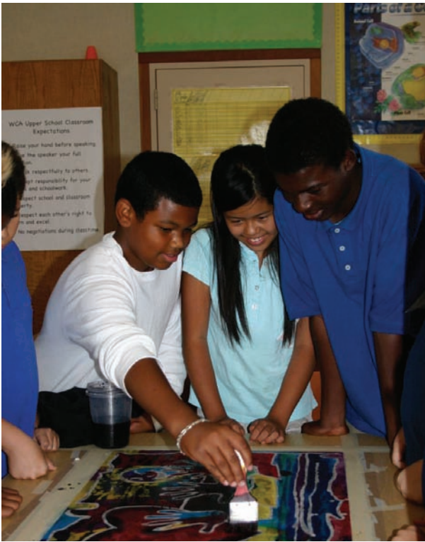
Sausalito/Marin City students collaborate on a batik mural

One of the challenges Youth in Arts has grappled with in recent years is how to help schools create richer, more comprehensive arts programs that address students' needs at all grade levels.