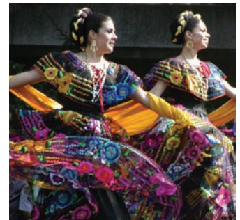
Ensamble Ballet Folklorico

The 2007-08 season included 28 performances by 13 companies for a total audience of over 10,000. We provided over 1,500