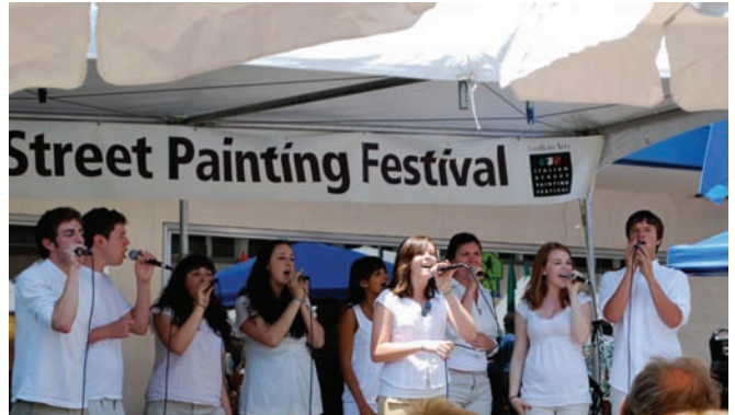
'Til Dawn, 2008.