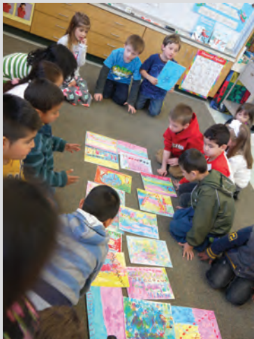
Students reflecting on their work