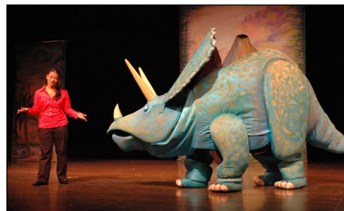
Hudson Vagabond Puppets

Youth in Arts' Performing Art Series (PAS) provides live theater, music and dance in matinees by national and